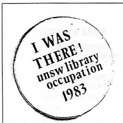
A badge commemorating the 1983 library sit-in, a protest about declining library funds. (M. Bate. 95A16)

There are references to other Australian universities (the Universities of Queensland, Sydney, Adelaide and