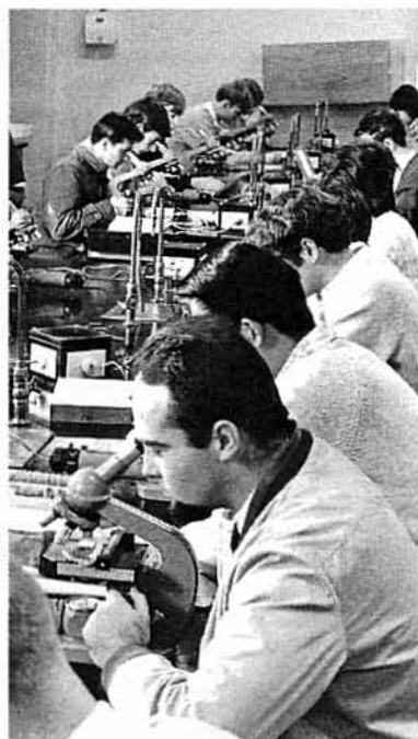
One of the photographs collected for the History of Medicine. (95A39)