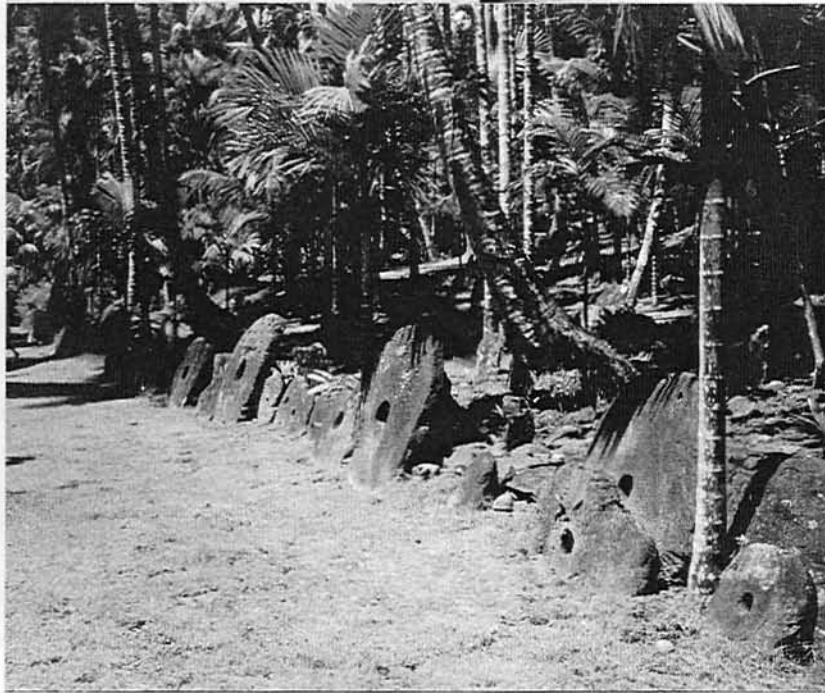
Traditional stone money: an example of archival records peculiar to Yap.

The workshops preceded the three day conference, the theme of which was 'Preservation of Culture through Archives and Libraries'. Delegates included librarians, archivists and museum employees from Yap and its outlying islands as well as from other parts of Micronesia, including Guam, Palau, the Commonwealth of the Mariana Islands and the Marshall Islands. Of particular interest were the sessions on Yapese culture and traditions, including presentations of story telling, song and dance by members of the community. Other sessions included the relevance of research collections