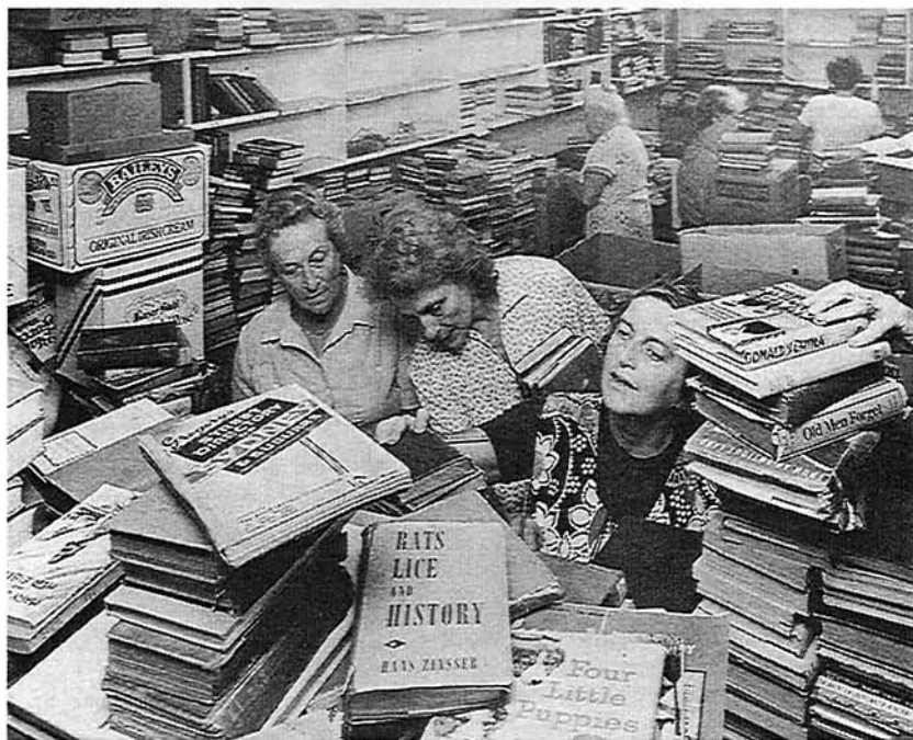
Members of the U Committee sorting books in the Chancellery basement in 1982. The bookroom has since moved to a much larger space in Unisearch House.