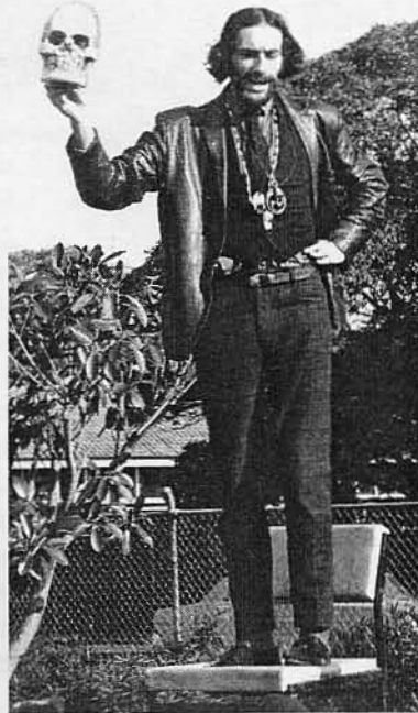
The Wizard was a prominent part of UNSW campus life in the late 1960s. (CN122/891)

The catalogue of potential problems for those concerned about long-term preservation can seem endless. Yet records, like humans, often have a remarkable capacity to survive given half a chance. To this end we would like to recommend, to those readers interested, the State Library of New South Wales' regular series of public workshops on preserva-