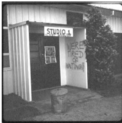
Graffiti protest at Studio One as part of the continuing campaign for more theatre space on campus, April 1980. [CN50]

Crucial to the historical recognition of D10 as a theatre is the fact that most users of the space regarded it as a classroom rather than as a theatre. Towards the end of the 1970s the GRS discovered that it no longer had an accessible 'theatre space' because classroom shortages meant that the building was in constant use as a classroom. GRS activities were subsequently limited, then, to 'lunchtime performances two days a week', while evening performances were restricted because of issues over the use of sets.