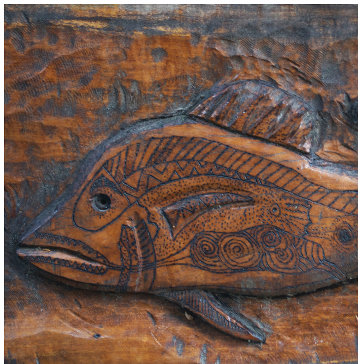
► Fish carving at Yarra Bay