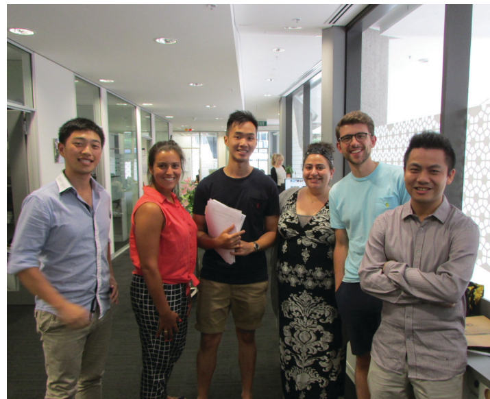
▶ KLC Students