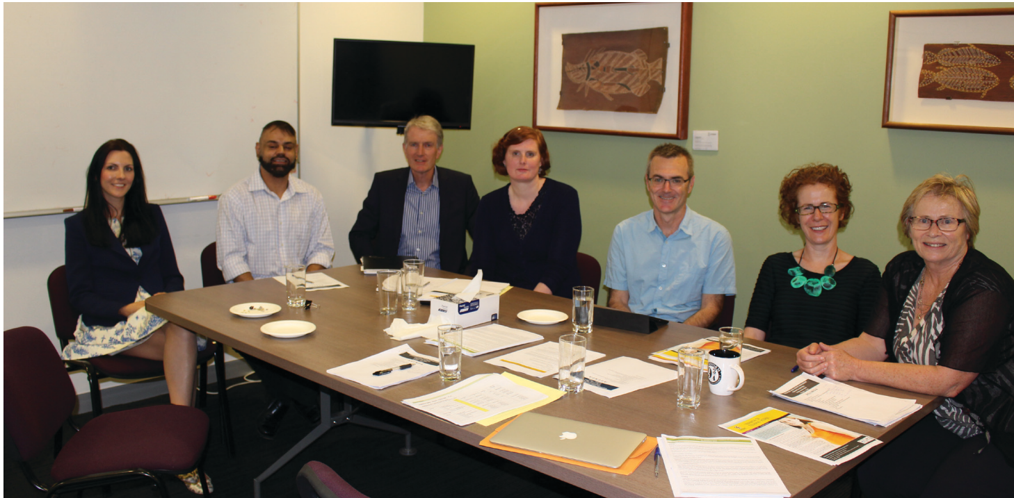
► KLC Management Committee