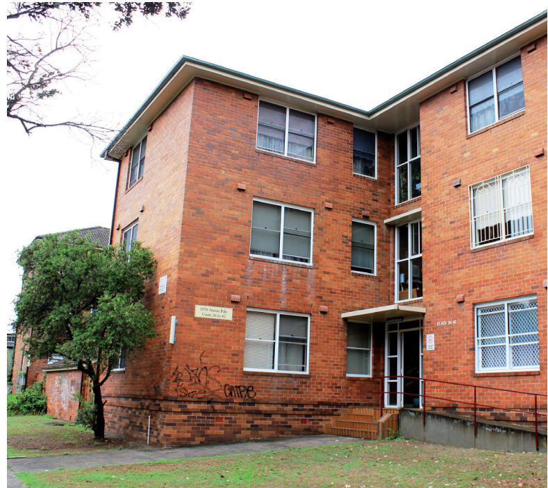
► Nimitz Housing Estate, South Maroubra

7. To improve the community's knowledge of the legal system and the capacity for people to enforce their legal rights, by delivering community legal education