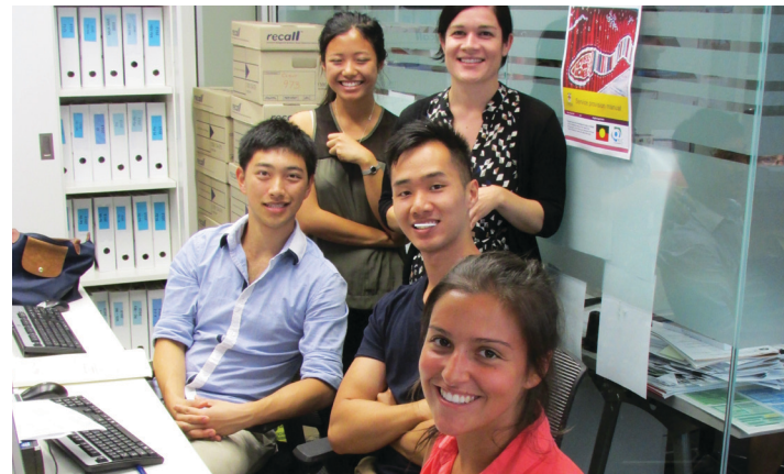
► KLC Family Law students