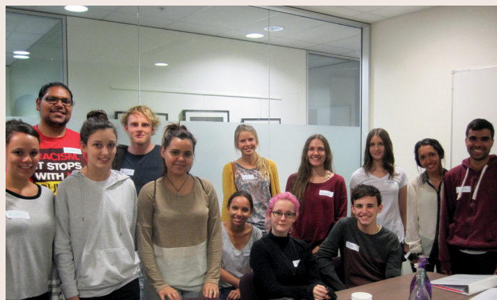
► Pre-Law Students 2014

The Foundations Enrichment II Course is designed to assist first year Indigenous students to settle into university studies and develop oral and written communication skills in a legal setting. The KLC course engages law students in the day to day operation of the legal system and lawyering, and bridges the gap between the theory and practice of the law. Students are given the opportunity to assist people in our community with their legal problems while also acquiring valuable communication skills.