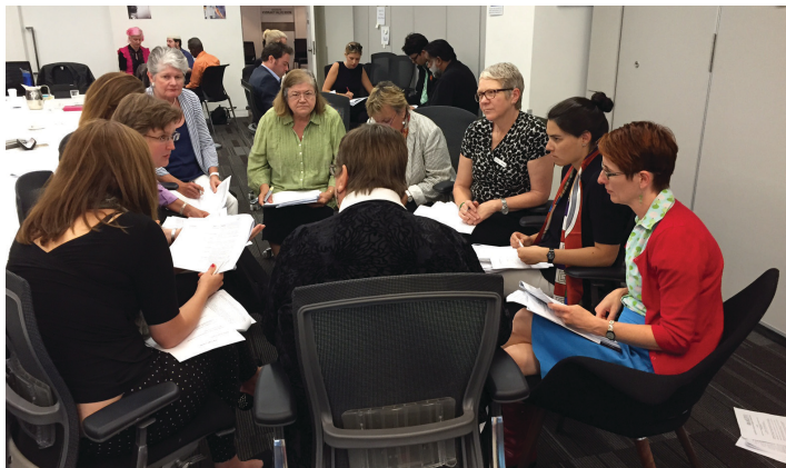
▶ UPR Workshop

Kingsford Legal Centre has a dedicated Law Reform and Policy Solicitor position focusing on proactive and reactive law reform and policy projects, which aim to address systemic injustice and improve the lives of our disadvantaged clients. Our law reform projects are informed by the advice and casework of the Centre.