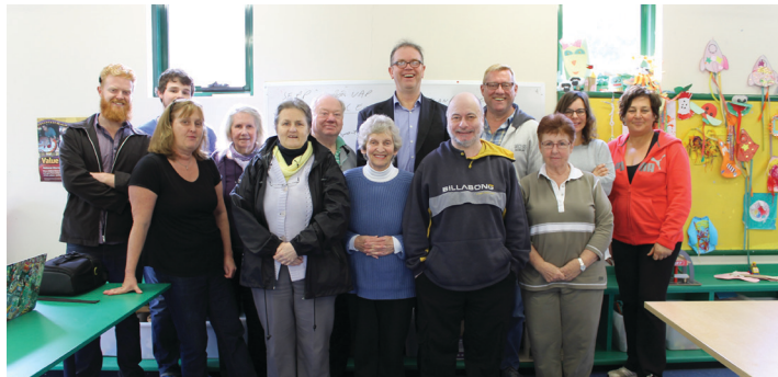
▶ SWAG members at Planning for Non-Planners Seminar

For over 30 years KLC has prioritised getting out into our community and working closely with community organisations to ensure that we understand their concerns and legal issues and respond appropriately. Our work over 2014 increasingly focussed around Kooloora Community Centre and the tenancy and campaign groups that they resource.