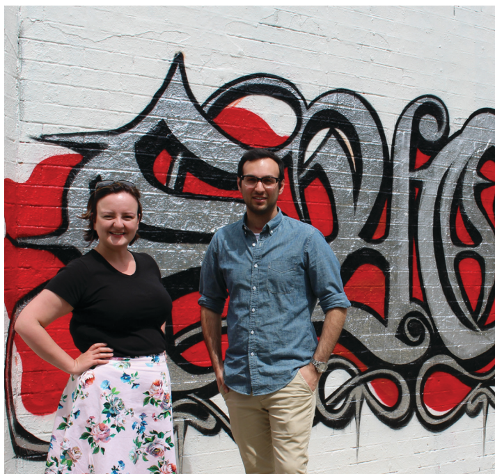
► KLC students at Kooloora Outreach

In 2014 we evaluated our Kooloora outreach. The outreach is very successful in reaching vulnerable public housing clients and the partnership with Kooloora is very strong. New procedures were put in place around coordination of the clinic as a result of the feedback. Our evaluation found that our work in partnership with Kooloora staff was key to the success of the clinic.