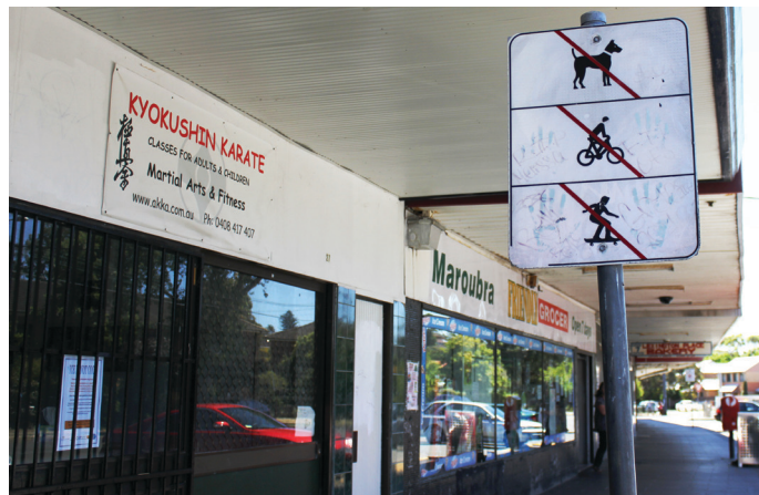
▶ Lexington Place, South Maroubra