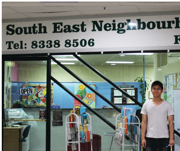
► KLC student at SENC Outreach

Our outreaches are an important part of KLC's service delivery to our clients. The location of our outreach clinics is informed by our Legal Needs Assessment of our catchment, requests by community organisations and workers, and our resources. The success of our outreaches is in large part due to the strong partnerships KLC has with local community organisations. We are very grateful for the warmth and generosity of all our outreach partners.