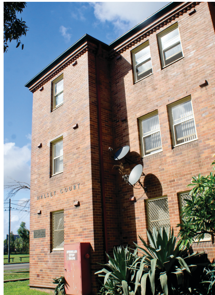
► Daceyville Housing Estate