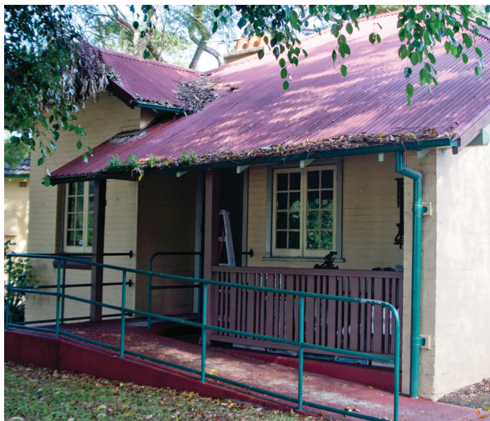
▶ Daceyville Public Housing

to the changes and how to make a submission for community organisations in our catchment area. The Prime Minister subsequently announced that the Government would not be proceeding with the changes due to a lack of community support for the change.