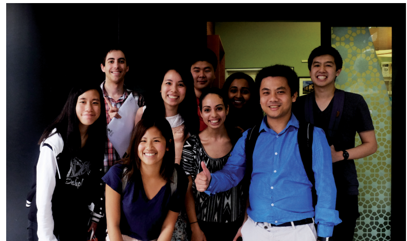
► Semester 2 2014 students

KLC Family Law Community Education Clinic (1 Day): This course has developed a range of legal education modules for community groups and community members with a focus on family law and the cross over with domestic violence. The students meet with community workers in the local area, then prepare and present community legal education workshops to members of the local community.