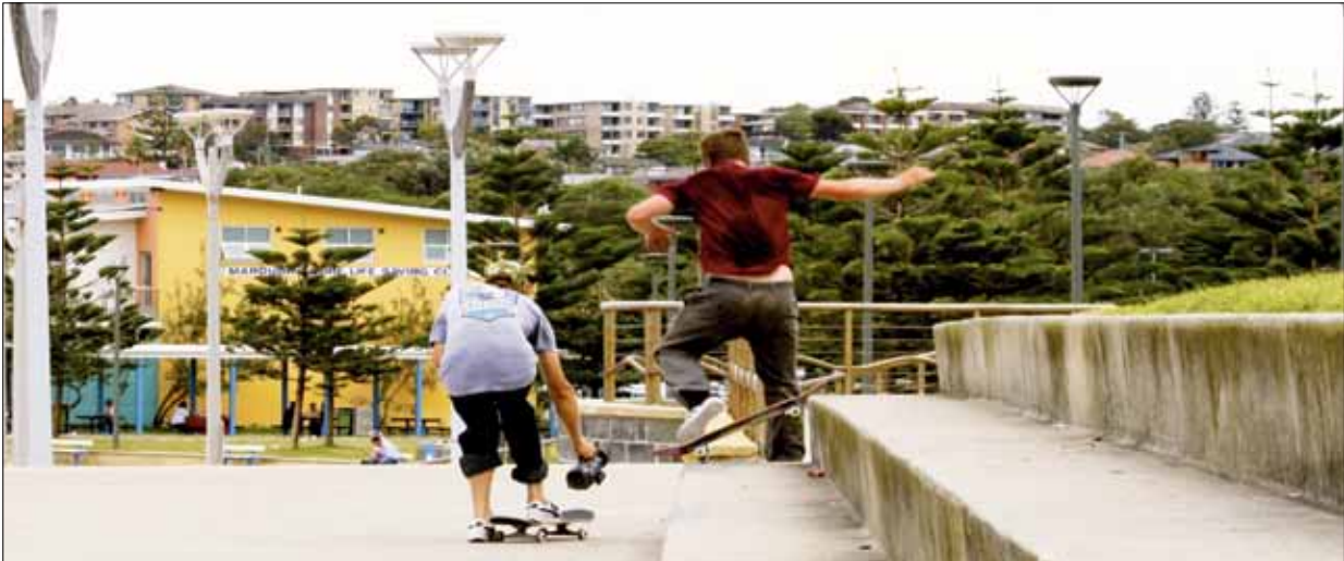
Maroubra Beach

In 2012 KLC undertook a major promotion of our services to our social housing clients. We leafleted all social housing residents in Botany Bay LGA and all of the smaller estates in Randwick. This was possible due to the generous support of private law firms Ashurst, Allens Arthur Robinson, Clayton Smith, Herbert Smith Freehills and Gilbert and Tobin who each printed pamphlets for us pro bono. Promotion of our Power of Attorney clinic focussed on nursing homes and CALD clients. Our employment clinic was promoted throughout the Hillsdale and Eastlakes areas.