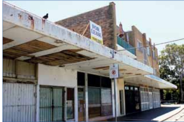
Lexington Place, South Maroubra