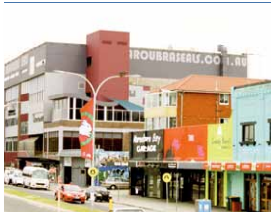
Maroubra Beach

KLC is currently participating in this project being led by the National Association of Community Legal Centres (NACLC). It involves putting together a comprehensive document which looks at our current service delivery to clients as captured in our CLSIS database and an analysis of predicted legal needs of our community using ABS data. The document will be an evidence-based one which will inform our next round of strategic planning in 2013 and will also be used in funding applications and for more focussed promotion of the Centre. The first draft of the document was completed in December, however it will be updated in 2013 to incorporate 2011 census data as it becomes available.