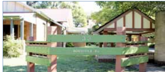
Social Housing in Daceyville

KLC has contributed to the policy development of the draft Human Rights and Anti-Discrimination Bill since 2010. In 2012 we worked with the National Association of Community Legal Centres (NACLC) to coordinate and draft community legal centre responses to the Government's Discrimination Consolidation Discussion Paper and the subsequent draft Human Rights and Anti-Discrimination Bill . We also appeared before the Senate Committee to give evidence on the Draft Bill. We also worked with other community legal centres to highlight in the media and to politicians the significant advances the draft Bill would make for our clients. We are extremely disappointed that the Government did not proceed with the Bill. It is a missed opportunity to make Australia's discrimination laws simpler and fairer.