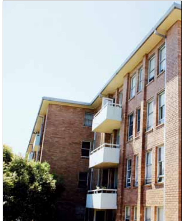
Namatjira housing estate

The Foundations Enrichment Course is designed to assist first year Indigenous students to acclimatise to university studies and develop graduate attributes of oral and written communication skills in a legal setting. Through engaging law students in the day to day operation of the legal system and lawyering, the clinical placement bridges the gap between the theory and practice of the law. Students are given the opportunity to assist people in our community while simultaneously acquiring valuable communication skills.