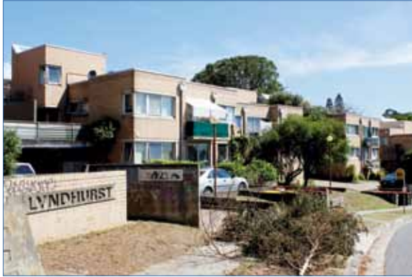
Mirrabooka estate

impairment. KLC advocated on behalf of the client with the superannuation company and the payment was eventually made to the client, without having to lodge a formal disability discrimination complaint to the ADB or AHRC.