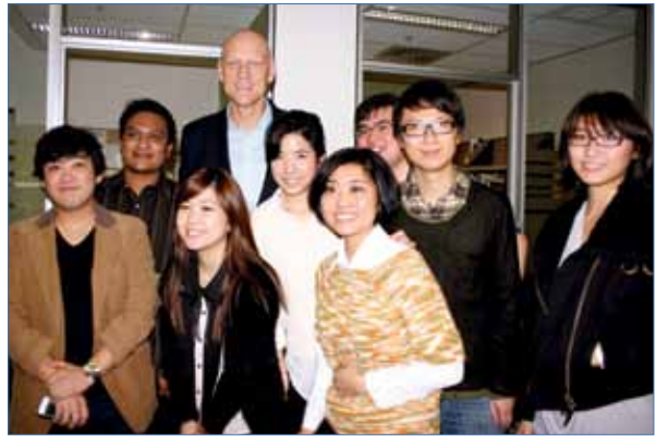
KLC clinical students with the Hon Peter Garrett MP

KLC Family Law Community Education Clinic (1 Day) has developed a range of training modules for various community groups and community members focussing on family law and the cross over with domestic violence. Six students came through this clinic each semester. The students meet with workers in the local area, then prepare and present community legal education workshops to members of the local community. During the year we integrated mock presentations by students into the course to improve the design and effectiveness of the presentations.