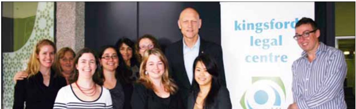
KLC staff with The Hon Peter Robert Garrett AM MP