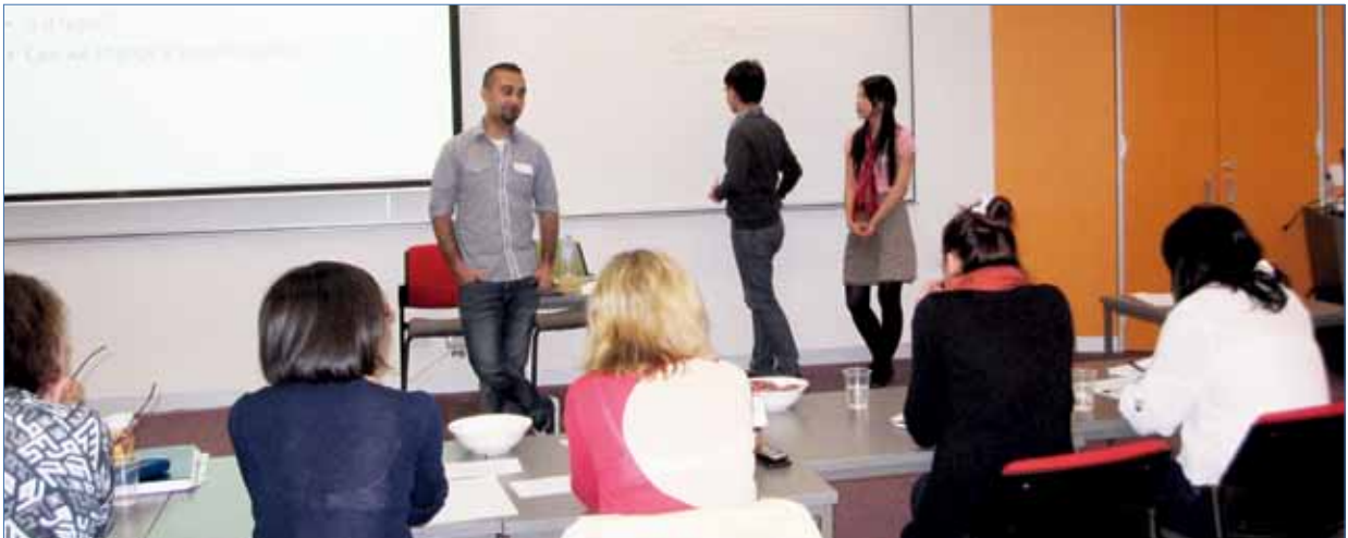
KLC students delivering a Family Law CLE

Feedback and evaluation of the clinic by its students reveals that students have developed an understanding of the importance of non-government organisations in the lives of women who are going through NSW Local Courts and the Family Law Courts. They have also developed a good understanding of the family law system and the dynamics and affects of domestic violence on women, children and the society in general. Such an understanding has enriched the educational experience of the students as they report to have become more sensitive, aware and skilled, feeling more confident in their anticipated dealings with their future clients.