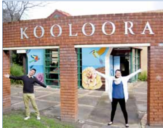
KLC students at Kooloora Community Centre - Malabar

In 2012 KLC staff participated in a number of community events including: a mini-legal expo to celebrate Law Week at the Randwick Branch of the Junction Neighbourhood Centre; Seniors Expo at Randwick Council; Know Your Rights Seminar at Bowen Library building in partnership with the Junction Neighbourhood Centre; the SENC 10th Anniversary at Eastlakes celebration; attendance at the Ngara Nura Agency Day at Long Bay Correctional Centre and NAIDOC celebrations at Yarra Bay. KLC students also organised a cake stall as part of UNSW Anti-Poverty Week program. The students took this opportunity to promote the work of local neighbourhood centres and their grassroots work in alleviating poverty. Money raised from the stall was donated to the Kooloora Community Centre in Malabar.