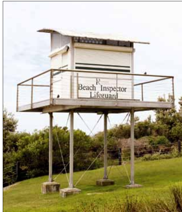
Malabar Beach