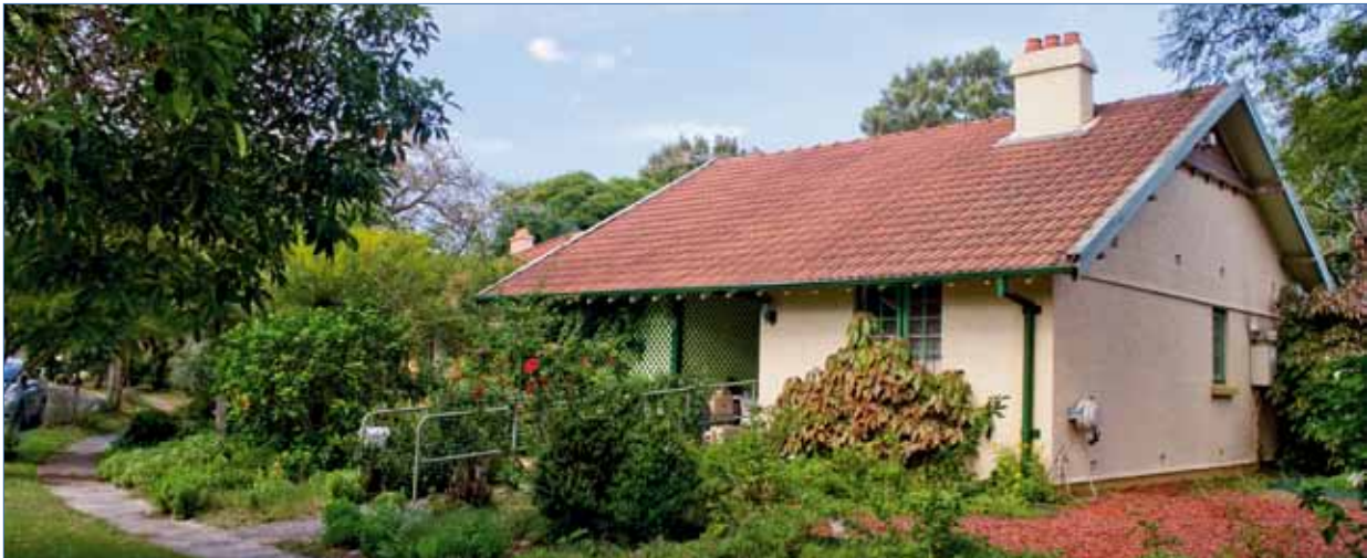
Daceyville Housing Estate