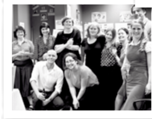
KLC Staff, Secondees and Friends (past and present)