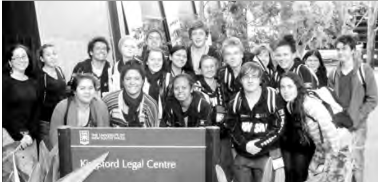
Winter School Students 2011