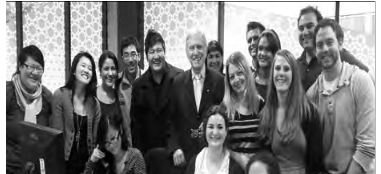
KLC students enjoy a visit by Justice Michael Kirby