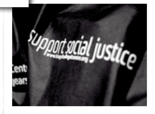
KLC - supporting social justice for 30 years