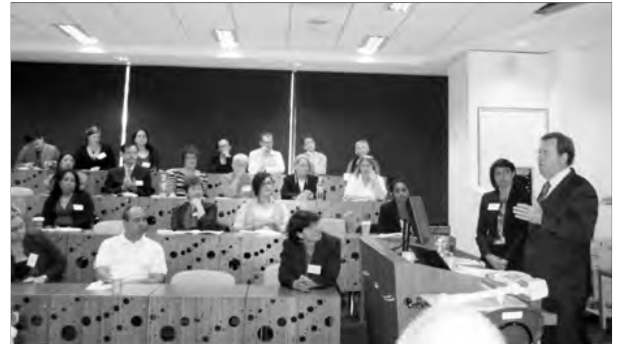
Attorney General The Hon Robert McLelland opening the National Clinical Conference