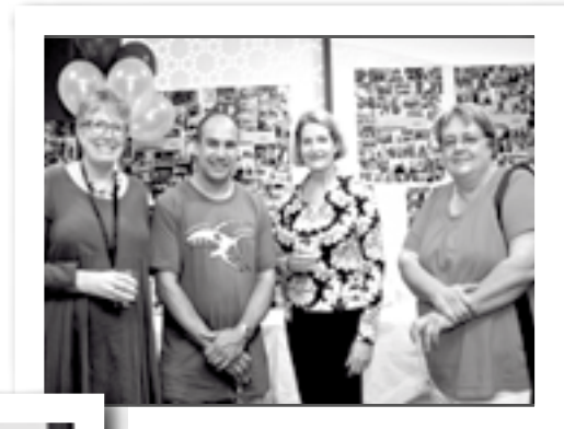
KLC staff and friends