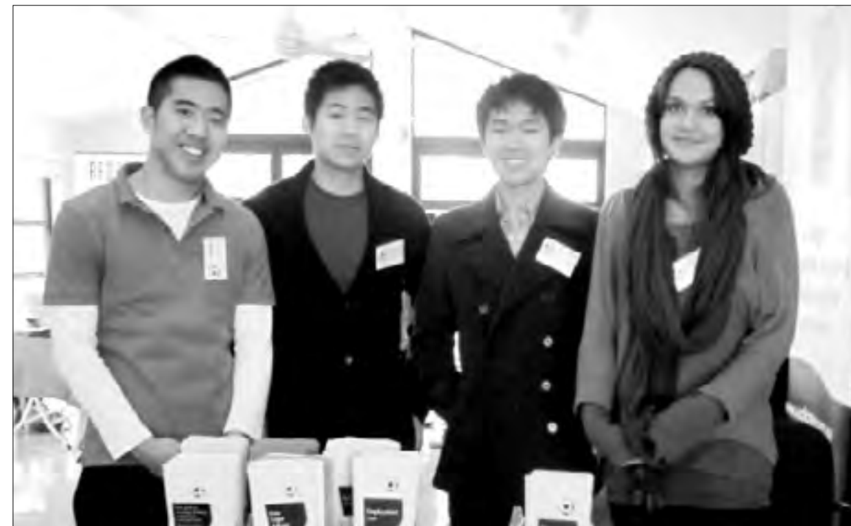
KLC students at Legal Expo and CLE