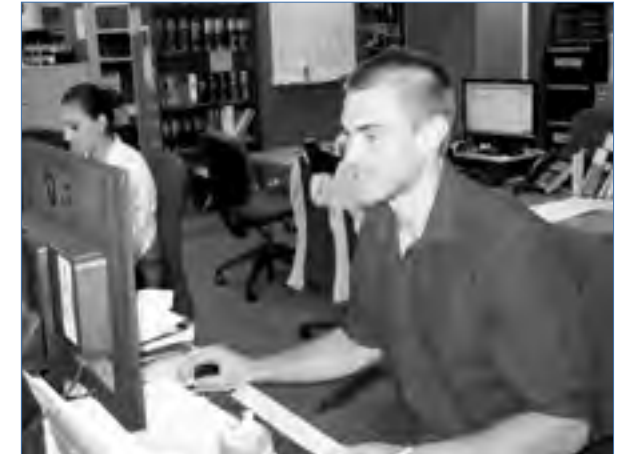
Clinical students at the Centre

In 2011 we ran for the ninth time the Foundations Enrichment course for first year Indigenous students. The program is designed to assist first year Indigenous students to acclimatise to university studies and develop graduate attributes of oral and written communication skills in a legal setting. Through engaging law students in the day to day operation of the legal system and lawyering, the clinical placement bridges the gap between the theory and practice of the law. Students are given the opportunity to assist people in our community while simultaneously acquiring valuable communication skills.