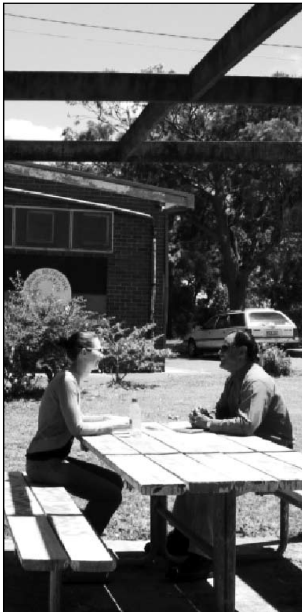
Providing legal advice at Yarra House

The drop-in service at Yarra Bay House, La Perouse was continued throughout 2008. This service is one of the strategies that we have implemented to increase and improve the access to KLC by the local Aboriginal community. We would like to thank Guriwal Aboriginal Corporation and the La Perouse Local Aboriginal Land Council for their assistance in providing the venue and promoting this service.