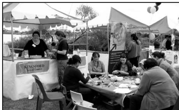
NAIDOC celebration at Yarra Bay