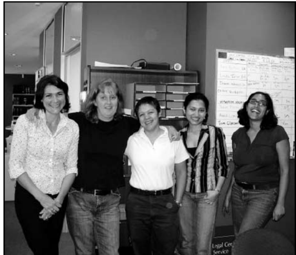
Cheerful workers at KLC