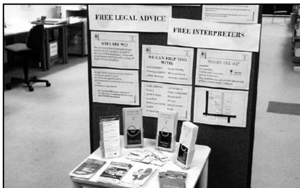
Display at Randwick City Library