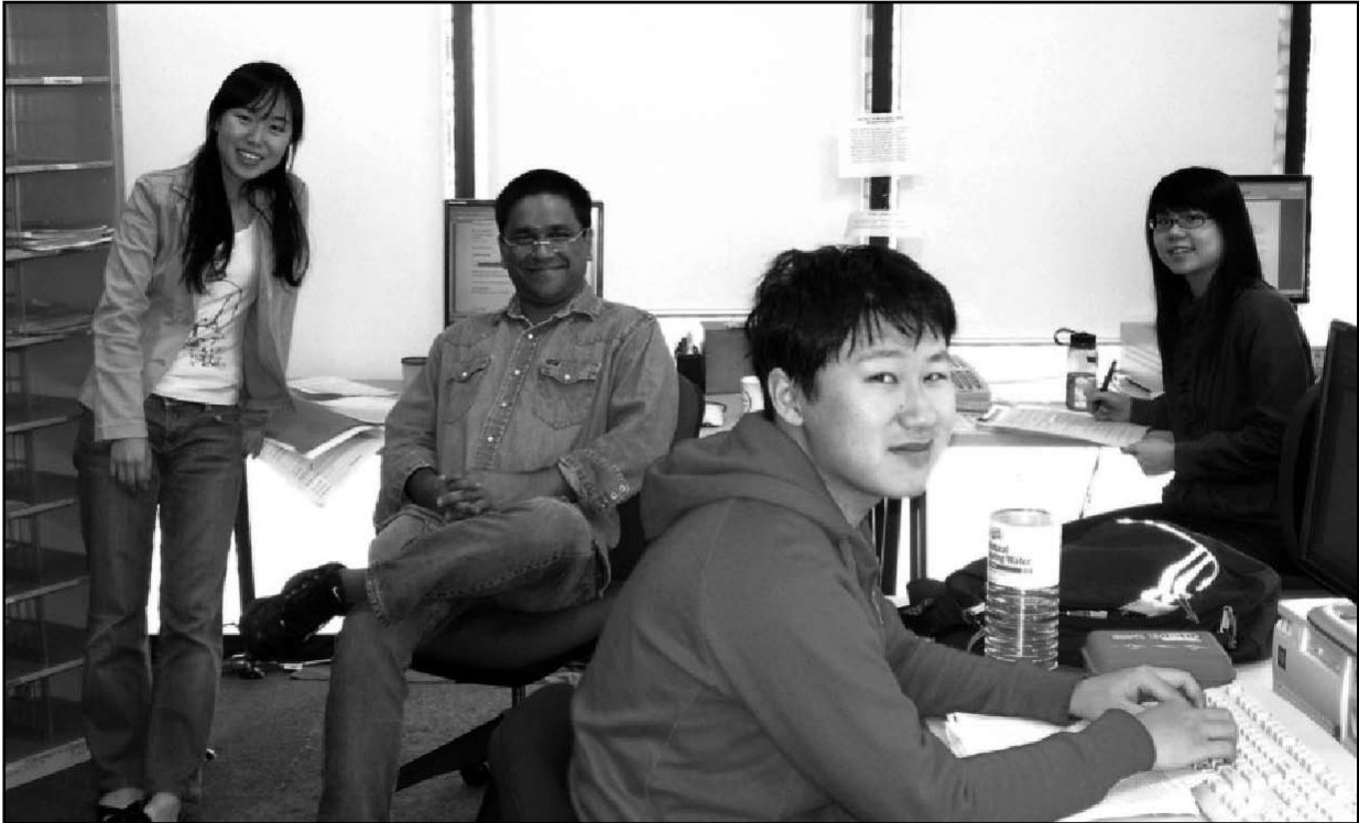
KLC students hard at work

International Covenant on Civil and Political Rights (ICCPR) to the UN Human Rights Committee (HRC). The ICCPR Report was contributed to by over 50 NGOs and supported by over 200. Our ICESCR and ICCPR Reports, which are known together as Freedom, Respect, Equality, Dignity: Action are a comprehensive analysis of human rights in Australia and include a range of targeted recommendations to address disadvantage. The CESCR and HRC will review Australia's implementation of ICESCR and ICCPR next year.