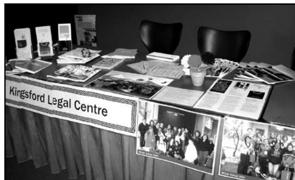
KLC display at the UNSW Indigenous Showcase

In partnership with The Deli Women and Children's Centre, KLC participated in the NAIDOC celebrations held at La Perouse. In addition to the information stall, activities such as making stress balls and necklaces were provided for the children.