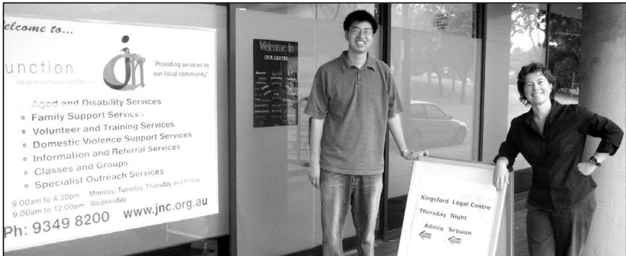
Outreach at the Junction Neighbourhood Centre