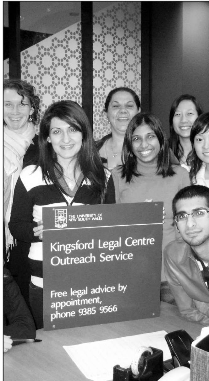
Semester 2 clinical students

In June the centre started a drop-in outreach service at Yarra Bay House in La Perouse. This outreach is one of the strategies we have implemented to increase and improve the access to KLC by the local Aboriginal community. We would like to thank Guriwal Aboriginal Corporation for their assistance in providing the venue and promoting this service.