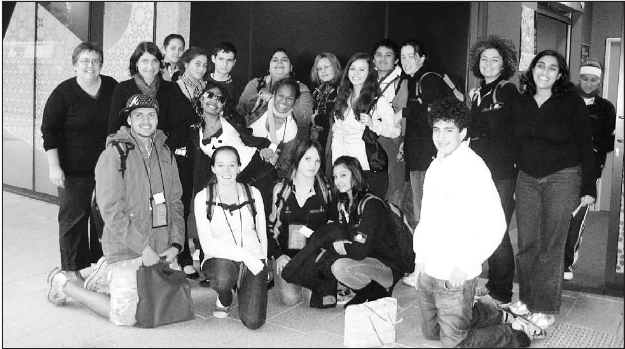
KLC staff with winter school Indigenous high school students

Indigenous access to, and retention in tertiary studies in the University. The Faculty of Law pre-law program is a well developed program with an introduction to various areas of law and excursions to expose students to a wide variety of University activities. We enjoyed the visit and are happy to be part of the program to increase Indigenous participation in law courses.