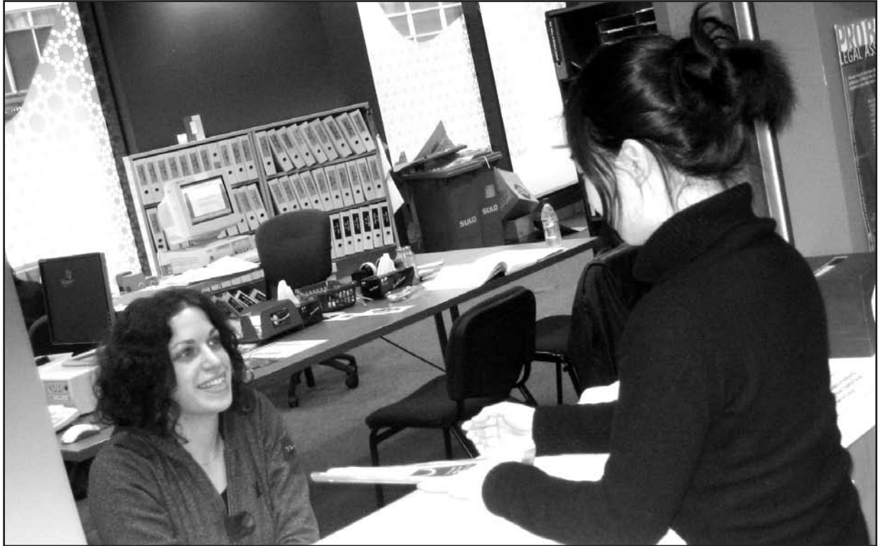
Providing assistance at reception.

Kingsford continues to be actively involved with the Domestic Violence and Victims Compensation Committee of the Combined Community Legal Centres Group of NSW, to work towards better outcomes for all our clients.