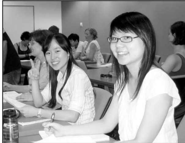
Students enjoying KLC seminar

All the work of the centre is undertaken as part of the clinical program – and is outlined in more detail throughout this report. Some of the highlights of the course during 2007 were: