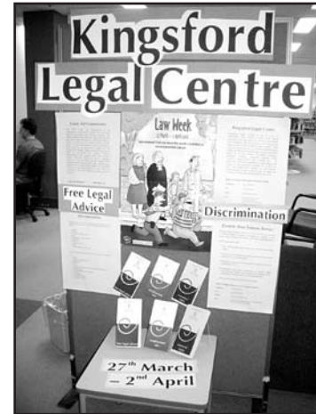
Law week display

2 % of our clients identified themselves as Aboriginal or Torres Strait Islander