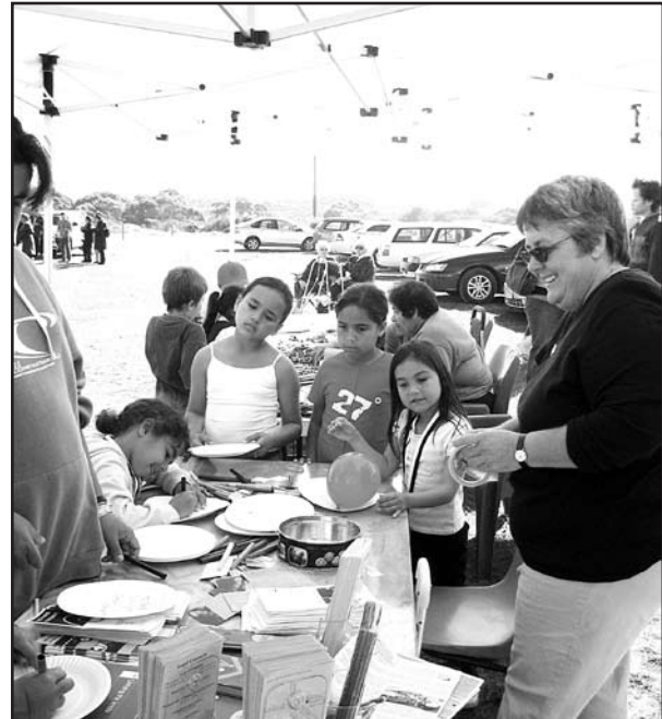
KLC stall at NAIDOC celebrations