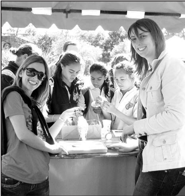
KLC students celebrating Women's Day at Kooloora Community Centre