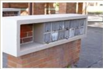
Bilga Crescent, Malabar

KLC staff have been working with this group around meeting protocol and procedures to help them to overcome problems they have been experiencing. This has been very productive for the group.