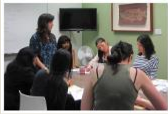
Family Law CLE

In May the Federal Government informed Kingsford Legal Centre of a cut in the funding of the Family law community education clinic by $100,000. The cut is for $50,000 per year over two years - 2015/16-2016/17. KLC is very disappointed that this valuable resource for our local community will be reduced. Many other community legal centres were also affected by the cut in funding.