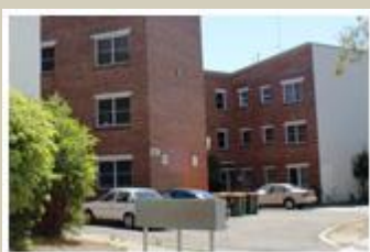
South Maroubra Estate