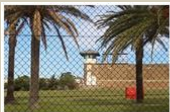
Long Bay Correctional Centre

KLC staff attended this event where they made contact with a number of prisoners soon to be released and talked about their legal problems and how KLC could assist them.