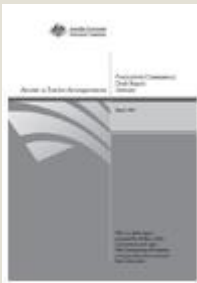
Productivity Commission Inquiry into Access to Justice Arrangements

The Productivity Commission released their draft report on access to justice arrangements. KLC made a submission responding to a number of information requests and draft recommendations, focusing particularly on draft recommendations to change the way CLCs are funded. We emphasised the value of our connection with our local community and how that enables effective community advocacy. We also argued against competitive tendering as a model for legal service provision.