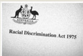
Racial Discrimination Act 1975

The Federal Attorney-General released an exposure draft of a bill proposing to reduce protections against racial vilification. KLC sent the Attorney-General a letter detailing our concerns about the proposed changes. These include that the current provision effectively mean serious offence, and provide an important educational tool for the community about public speech. We also suggested