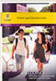
Clinical Legal Education Guide 2014

KLC has published the Australian guide to clinical legal education programs. The guide lists clinical legal programs offered by Australian universities. The Guide is available here . If you would like a hard copy contact us .