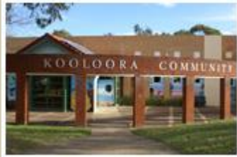
Kooloora Community Centre

A number of local community organisations working in this area have been meeting to discuss the unmet need of this most disadvantaged part of our catchment and working on solutions to attract more funding. Community workers reported on the escalation of the needs of these very vulnerable communities and the difficulties of the unrealistic funding extended to our organisations by government. The crisis in public housing in a time of extreme rent in this area has been identified as the main driver behind the issues faced by many of our clients. This is reflected in the advice and casework of the Centre.