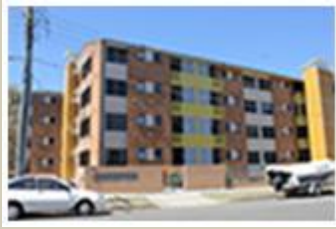
Gallop Court Estate, South Maroubra

KLC acted for a client who was made homeless after experiencing domestic violence from her partner. Our client had arrived in Australia on a permanent carer's visa. Housing NSW determined that she was ineligible for public housing because of this visa status. We successfully challenged that decision. Due to a lot of advocacy she was offered a flat and has happily accepted the new home for her and her son. Because of the urgent nature of this case almost every solicitor at the Centre helped this client and the case highlights how legal centres can work in the community, raise policy issues and respond to clients in urgent need.