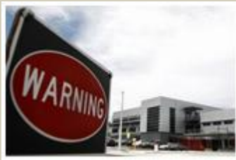
Long Bay Gaol

KLC helped a client who we first met when he was in Long Bay Jail. On his release he received a large restitution order from Victims Services. Our client had a serious mental illness and chronic health conditions. After his release from jail our client couldn't pay the restitution amount so we helped him prepare evidence of his circumstances to object to the amount. The Commissioner reduced the amount of the order to $1,000. The decision highlighted the circumstances of our client as at the time of the assault he was not receiving treatment for his mental illness.