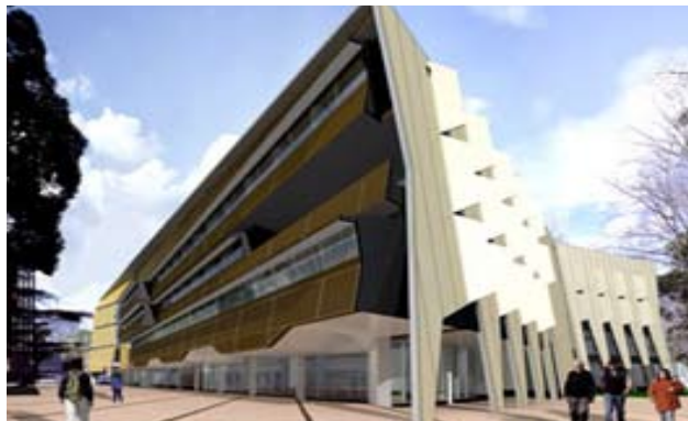
KLC'S NEW UNSW PREMISES.