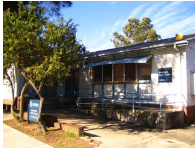
KLC'S OLD RAINBOW STREET PREMISES.

After 20+ years at our wonderful old weatherboard cottage in Rainbow Street, Kingsford Legal Centre has moved to the new Law Building on campus at the UNSW.