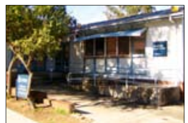
Rainbow Street KLC