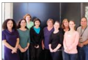
KLC staff June 2011