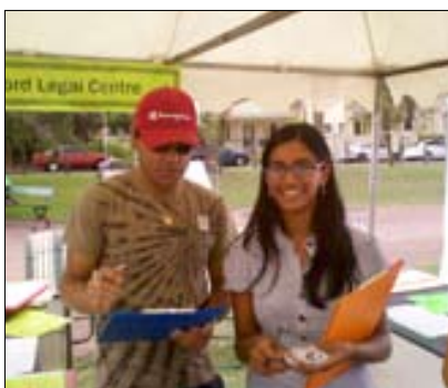
KLC staff and students at community fair

KLC used a whole of Centre, multi pronged approach in making a submission to the Brennan Committee, a national consultative committee commissioned by the Federal government on the need for improved human rights protections in Australia, which reflected the concerns of our community. We attended knitting & other social groups to chat, put articles in local newsletters, leafletted, mailed out, assisted people to produce their own submission, educated community groups about 'what are human rights' and assisted some to prepare their own submissions to the national consultation. KLC raised the issue at every forum possible – from community fairs, to shopping malls, mail outs, talking to our clients, resourcing our local community centres and specific seminars to local groups. KLC also produced its own submission to the consultation.