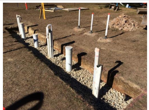
Field-scale replication of legacy waste trenches at Little Forest Site, Sydney Australia. Photo shows one of four trenches excavated to replicate hydraulic and biogeochemical processes, and also to test remediation technologies (e.g. in-situ grouting using colloidal silica).

Shotgun metagenomics coupled with multiple field- and laboratory techniques allowed the reconstruction of major biogeochemical pathways at the Little Forest Legacy Radioactive site, Australia. This is essential for understanding contaminant migration pathways