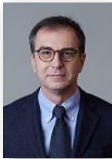
Leonardo Gambacorta, Bank for International Settlements