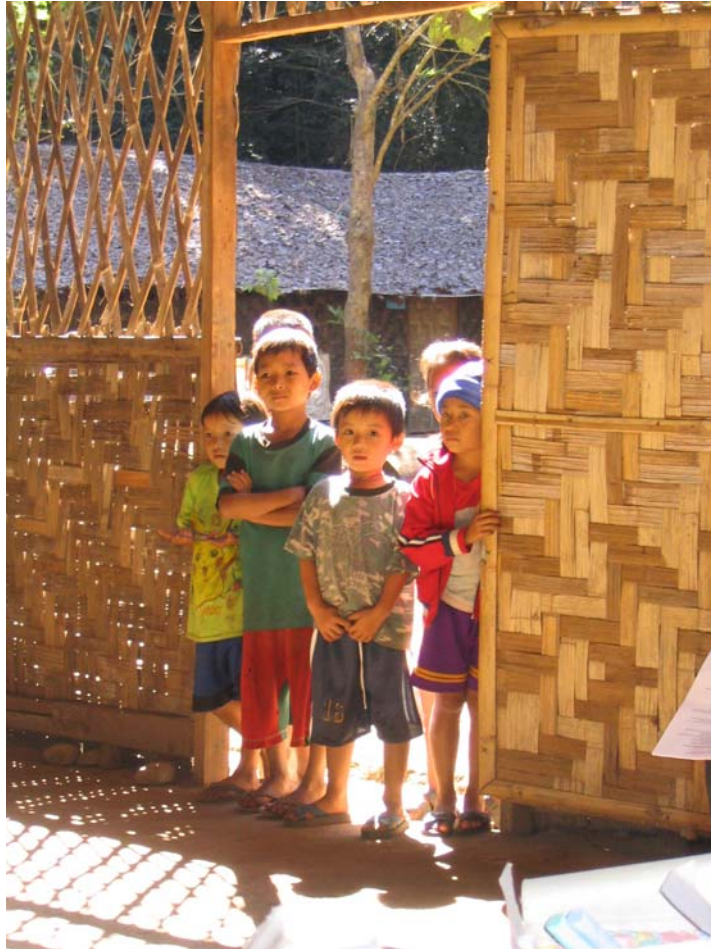
Refugee children, Thai-Burma border