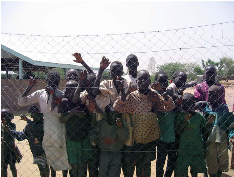
Refugee children in a holding centre in Lokichokio, Kenya, near the Sudanese border

It is estimated that about 50% of the approximately 12 thousand people who enter Australia annually as part of the Refugee and Special Humanitarian intake are children and young people. These children have often suffered from severe hardship, have had their sense of safety violated, suffered physical abuse, neglect, abandonment, sexual abuse and exploitation, been forced to fight as child soldiers and have witnessed and/or been tortured.