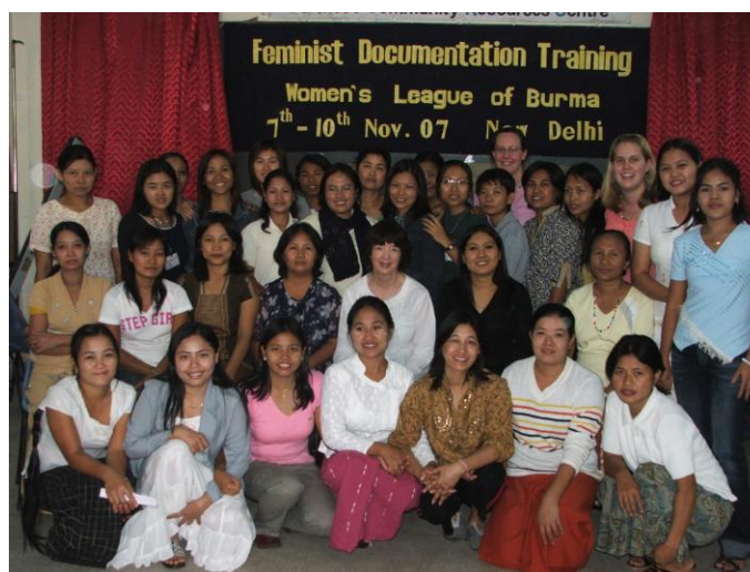
Women's League of Burma New Delhi

“sexual abuse and harassment..., in the workplace...with landlord...every time you step outside. There is the issue of maid servants and sexual slavery. Then there are issues about exploitation in all areas of life because you appear to be from Burma, discriminated against. Then there is the issue of arrest, torture & rape. Fleeing from home, forced relocation, death and child abandonment... issues of widows and single women who are never safe...Domestic violence. Issues in relation to police, lack of access, protection and their invasion and intruding into homes. Issues of subsistence allowance, unemployment and poverty. Child abduction, child rape and education denied”