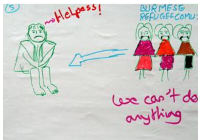
Feelings of helplessness

The long term uncertainty felt by refugees as they wait for determination of their status, in addition to the other stressors in their lives, significantly increases the chance of mental illnesses such as depression. Due to their unregistered status they lack assistance from any formal service providers and are at a greater risk of exploitation by landlords and employers. They have no access to local trusting authorities and therefore have no means for redress over disputes.