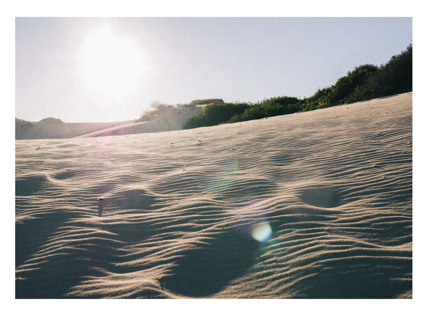
UNSW's Indigenous strategy

UNSW Arts, Design and Architecture Kensington and Paddington campuses are built on Aboriginal Lands. We pay our respects to the Bidjigal and Gadigal peoples who are the Custodians of these lands. We acknowledge the Aboriginal and Torres Strait Islander peoples, the First Australians, whose lands, winds and waters we all now share, and pay respect to their unique values, and their continuing and enduring cultures which deepen and enrich the life of our nation and communities.