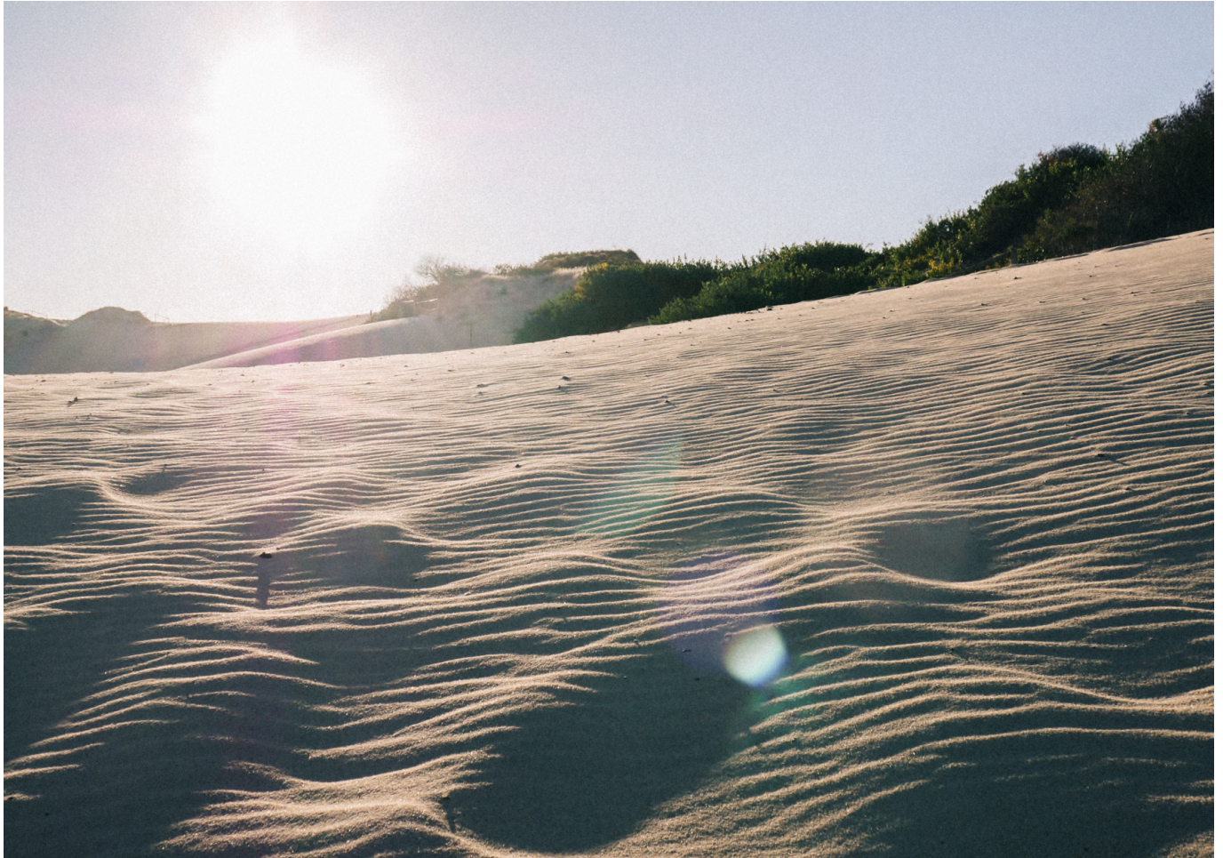
UNSW's Indigenous strategy

UNSW Arts, Design and Architecture Kensington and Paddington campuses are built on Aboriginal Lands. We pay our respects to the Bidjigal and Gadigal peoples who are the Custodians of these lands. We acknowledge the Aboriginal and Torres Strait Islander peoples, the First Australians, whose lands, winds and waters we all now share, and pay respect to their unique values, and their continuing and enduring cultures which deepen and enrich the life of our nation and communities.