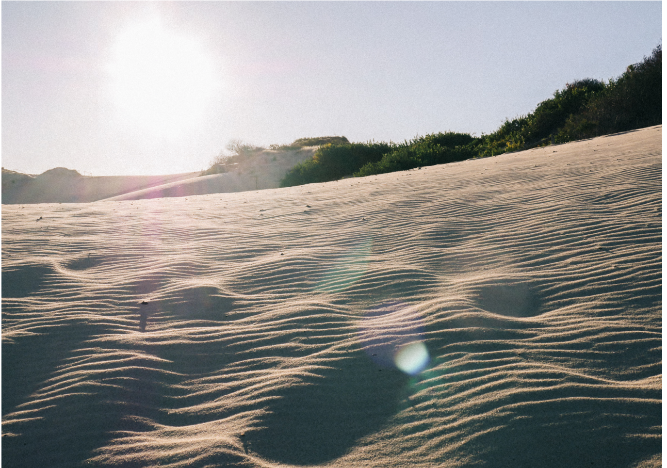
UNSW's Indigenous strategy

UNSW Arts, Design and Architecture Kensington and Paddington campuses are built on Aboriginal Lands. We pay our respects to the Bidjigal and Gadigal peoples who are the Custodians of these lands. We acknowledge the Aboriginal and Torres Strait Islander peoples, the First Australians, whose lands, winds and waters we all now share, and pay respect to their unique values, and their continuing and enduring cultures which deepen and enrich the life of our nation and communities.