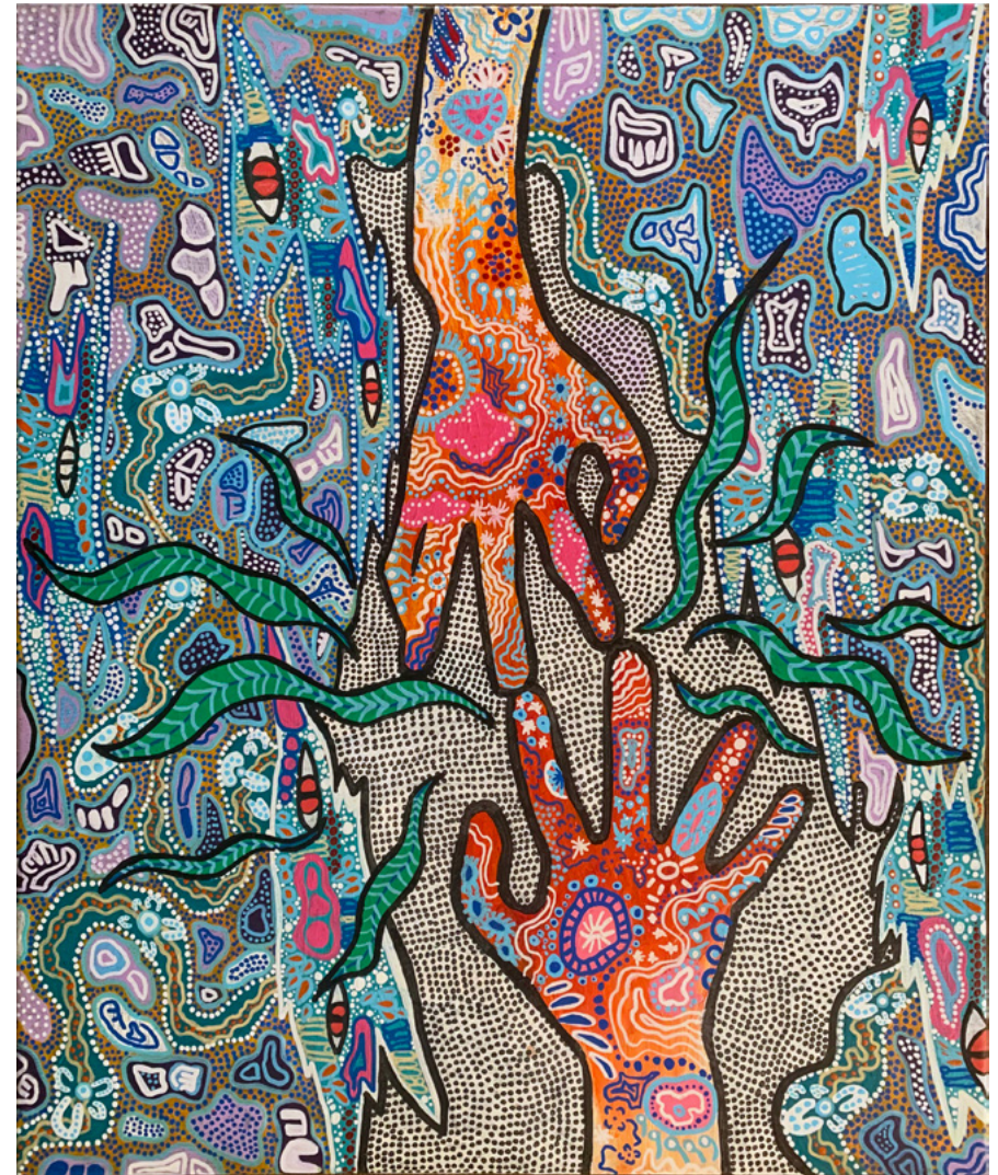
'This artwork was commissioned by UNSW Arts, Design & Architecture.'